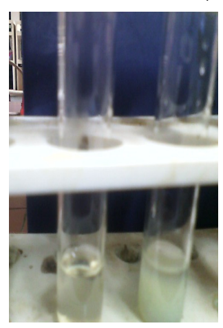
Control Test Before 72 hours

The antibacterial activity of nanoparticles against lactibacillus was identifed. This reaction is allowed in bright condition within 72 hrs. The color of test tubes changes fron white to dark brown as a result in the formation of silver nanoparticles.