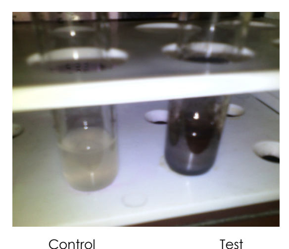
Control After 72 hours