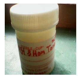
Fig.1: Shows different milk and curd samples