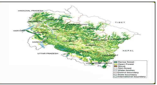
Figure 2: Forest in Uttarakhand