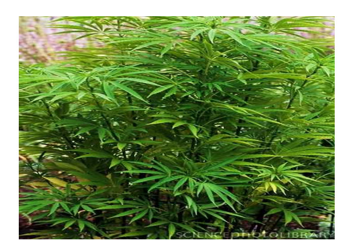
Figure 1: Morphological appearance of Leaves showed that belongs to Kingdom-Plantae, Class-Magnoliopsida, Order-Rosales, Family-Cannabaceae, Genus-Cannabis, Species-Sativa L

anti-tumour effects of anandamide-related compounds and other cannabinoid agonists in thyroid, breast and prostate cancers. Unexpectedly, rimonabant per se showed a potential anti-tumour action in thyroid, mantle-cell lymphoma and breast tumours both in vitro and in vivo [1]. Cannabinoids in cancer therapy as palliative agents the potential application of cannabinoid agonists as agents is still at the preclinical level. Meanwhile the cannabinoids are emerging as valuable adjunctive agents for optimizing the management of multiple symptoms of cancer and the treatment of therapyrelated side-effects [19,20]. Regarding effectiveness, cannabinoids exert notable antitumour activity in animal models of cancer, but their possible antitumour effect in humans has not been established. Regarding toxicity, cannabinoids not only show a good safety profile but also have palliative effects in patients with cancer, indicating that clinical trials with cannabinoids in cancer therapy are feasible (17, 21]. As cannabinoids are relatively safe compounds, it would be desirable that clinical trials using cannabinoids as a single drug or in combined anticancer therapies could accompany these laboratory studies to allow us to use these compounds in the treatment of cancer [12].