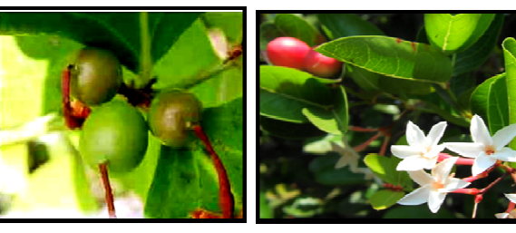
Figure 1: Photograph of C. carandas var. amara Linn. (F. Apocynaceae)

of millions of people every year (Shoba et al., 2001). Diarrhoea is an alteration in normal bowel movement and is characterized by an increase in the water content, volume or frequency of stools (Guerrant et al., 2001; Meite et al., 2009). In developing countries, there are large numbers of epidemiological and experimental evidence pertaining to worldwide acute-diarrhoeal disease, which is one of the principal causes of death in the infants, particularly in malnourished and which is of critical importance in developing countries (Syder et al., 1982; Lutterodt et al., 1989). Diarrhoea is one of the leading causes of death among children under five years globally. More than one in 10 child deaths- about 800 000 each year is due to diarrhoea (Nuthakki et al., 2014). Many synthetic chemicals like diphenoxylate, loperamide and antibiotics are available for the treatment of diarrhoea but they have some side effects. It is therefore important to identify and evaluate available natural drugs as alternatives to currently used anti-diarrhoeal drugs, which are not always free from adverse effects (Park et al., 2000; Hardman et al., 1992). Therefore, the search for safe and more effective agents has continued to be an important area of active research.