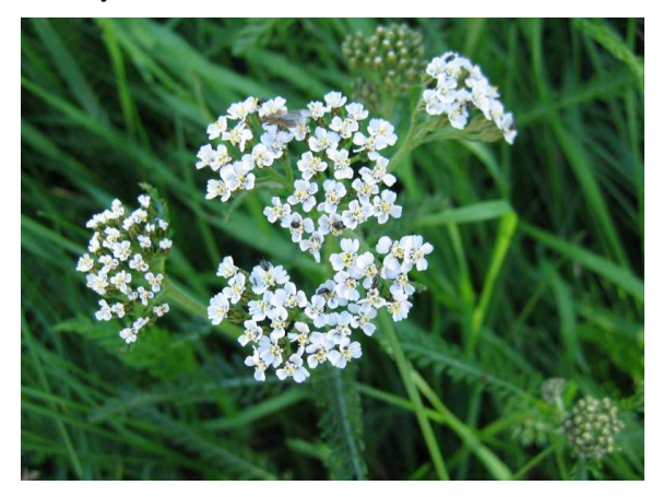
Fig 11: Achillea millefolium

diabetes treatment, digestion (stimulates)gastrodisorders<sup>179</sup>, choleretic<sup>181</sup> dyspepsia, intestinal eczema, fevers, flu's, gastritis, glandular system, gum ailments, heartbeat (slow), influenza, insect repellant, inflammation182, emmenagogue,183internal bleeding, liver (stimulates and regulates), lungs (hemorrhage), measles, menses (suppressed), menorrhagia, menstruation (regulates, relieves pain), nipples (soreness), nosebleeds, piles (bleeding), smallpox, stomach sickness, toothache, thrombosis, ulcers, urinary antiseptic, uterus (tighten and contract),gastroprotective<sup>184</sup> varicose veins, vision, may reduce autoimmune responses<sup>185</sup>. A decoction of the whole plant is employed for bleeding piles, and is good for kidney disorders. It has the reputation also of being a preventative of baldness, if the head be washed with it. Internally it is used for loss of appetite and dyspepsia. Externally it is used as a sitz bath for female disorders. 186,187It also possess anti-microbial, anti-oxidant anti-cancer activity.