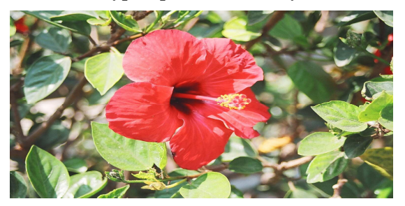
Fig 8: Hibiscus sabdariffa

protocatechuic acid, quercetin, stearic acid and wax <sup>119</sup>.Some studies indicates that it also found to possess Anti oxidant <sup>96</sup>,hepato protective <sup>120</sup> .anti cancer <sup>121</sup>,anti hyperlipidaemic activity <sup>122</sup>