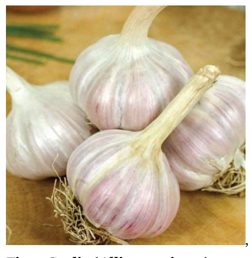
Fig 2: Garlic ( Allium sativum ) Anti-hypertensive activity of Garlic ( Allium sativum )

lower elevated blood lipids and as a preventive measure for age-dependent vascular changes; it does not note any contraindications<sup>23</sup>