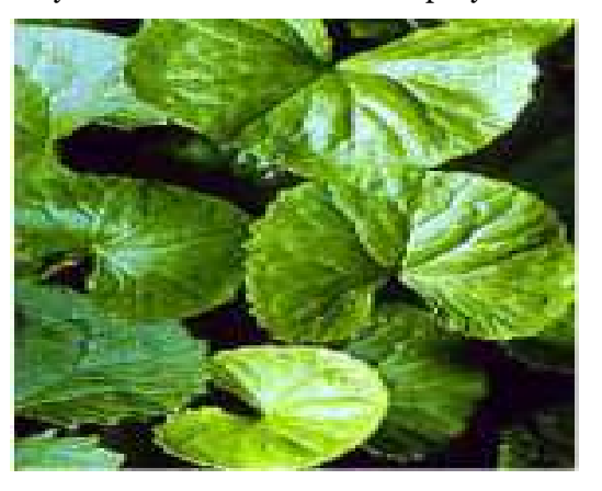
Fig 3: Gotu kola (Centella asiatica)