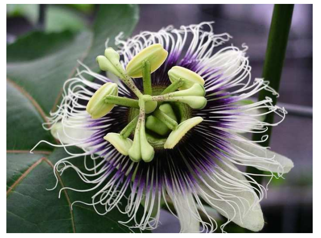
Fig 7: Passiflora Edulis Anti-hypertensive activity of Passiflora edulis:

Passiflora edulis possess potent Anti inflammatory<sup>97</sup>, Anti oxidant <sup>98</sup>Anti microbial <sup>99</sup>, Anti tumour, and Anti fungal activities.<sup>100</sup>