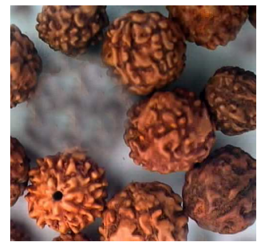
Fig 9: Elaeocarpus ganitrus Anti-hypertensive activity of Elaeocarpus ganitrus:

According to the Ayurvedic medical system, wearing of Rudraksha can have a positive effect on heart and nerves.