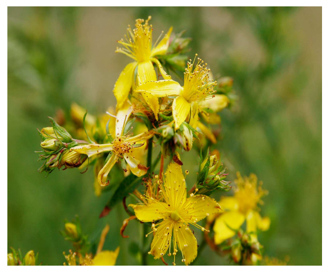
Fig 10: Hypericum perforatum

St John's wort is widely known as a herbal treatment for depression used In mild to moderate depression, 166,167posess anti viral activity <sup>168</sup> and wound healing property.<sup>169, 170</sup>