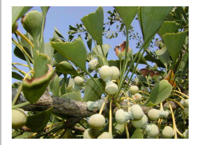
Fig 4: Ginkgo biloba Anti-hypertensive activity of Ginkgo biloba:

The 2 kidney, 1-clip (2K, 1C) model of hypertension was used investigate the potential to antihypertensive effect of a standardized leaf extract of Ginkgo biloba (EGb 761). Clipping of the renal artery resulted in gradual elevation of the systolic blood pressure (SBP) reaching a plateau after 4 weeks of surgery. Treatment of hypertensive rats with EGb 761 (60, 90, 180mg/kg/day orally) was therefore started 4 weeks after surgery and continued for 3 weeks. This led to a dose-dependent reduction in SBP with no significant change in heart rate. Control hypertensive rats showed a significant elevation of total protein thiols (Pr-SHs level) in both clipped and non-clipped kidneys as well as in the serum. However, glutathione peroxidase (GSH-Px) activity was decreased in the clipped kidneys but elevated in the non-clipped ones and in the blood. The malondialdehyde (MDA) level was raised in clipped kidneys but not in non-clipped ones nor in the serum. Nitric oxide (NO level) and angiotensin converting enzyme (ACE) activity were increased in both clipped and non-clipped kidneys but not in the serum. Endothelium-dependent and -independent relaxation of aortic rings towards acetylcholine (Ach) and sodium nitroprusside (SNP) were impaired. Treatment with EGb 761 (180mg/kg/day for 3 weeks) was associated with recovery of GSH-Px