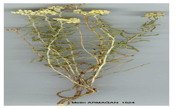
Fig 12: Achillea wilhelmsii C. KOCH