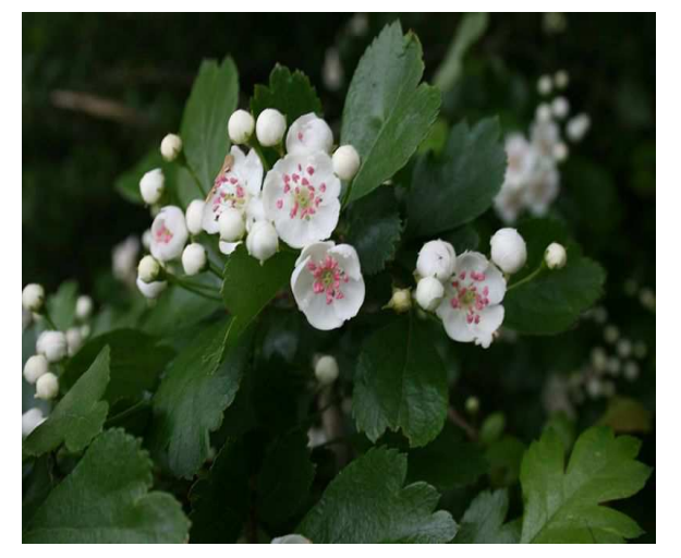
Fig 5: Crataegus oxycantha

oligomeric procyandins (OPCs, also found in grapes) and quercetin., <sup>84,85</sup>the leaves and flowers are used medicinally, and there is good evidence that hawthorn can treat mild-to-moderate heart failure. Antioxidants found in hawthorn may help stop some of the damage from free radicals, especially when it comes to heart disease.<sup>86</sup>